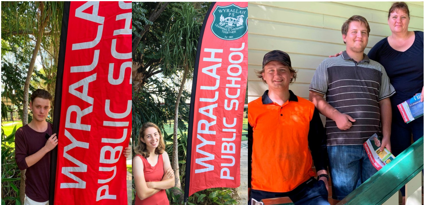
Some of our former students all grown up and returning to our lovely little school on Saturday