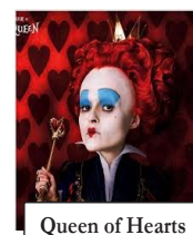
Queen of Hearts